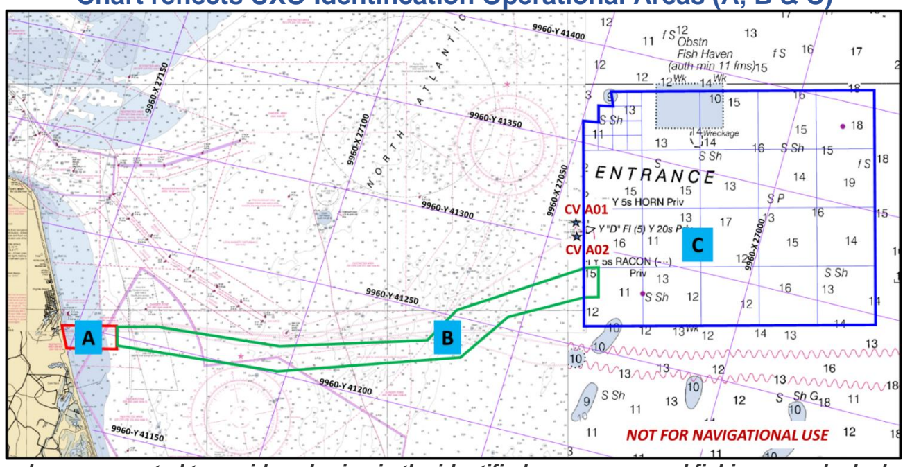
Chart reflects UXO Identification Operational Areas (A, B & C)

Vessels are requested to avoid anchoring in the identified survey area and fishing vessels deploying fixed fishing gear (e.g., pots, traps, gillnets, etc.) are requested to coordinate activities with the Fisheries Liaison to avoid damage to fishing gear and/or the survey equipment.